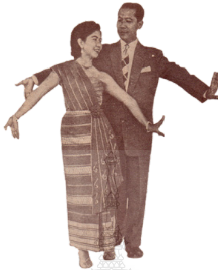
รำสาย Rum Sai